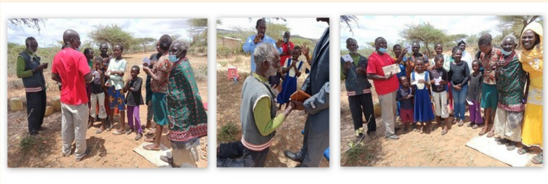
Receiving the Good News in Oldonyiro

Some of our JFM Maasai Pastors traveled to a village called Oldonyiro for a 3-day mission to preach the Good News. 15 people believed the truth of the gospel message and surrendered their lives to Yeshua! We are praising God for the great response in this remote area! Please pray with us as we follow the Holy Spirit's leading to plant a church in Oldonyiro so these new believers can be disciplined in God's Word.