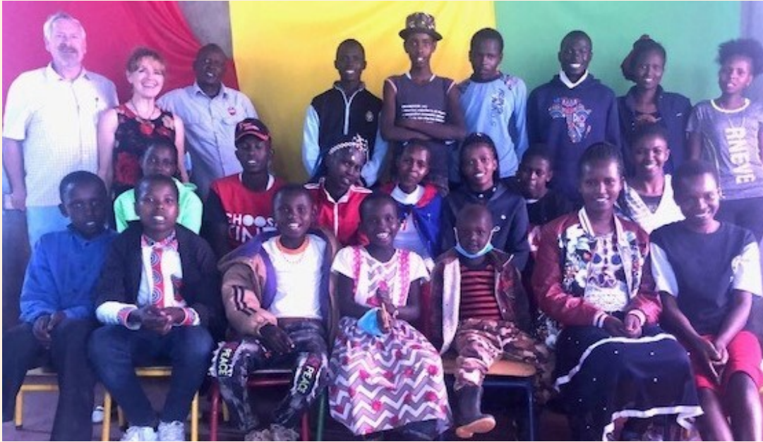
April 22 meeting with JFM Sponsored Students in the northern region.