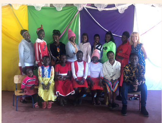
JFM SPONSORED FEMALE STUDENTS FROM NORTHERN KENYA