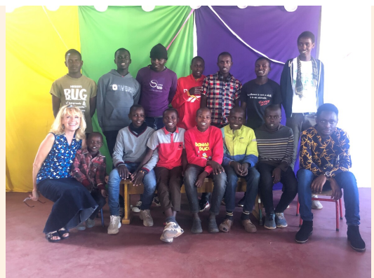
JFM SPONSORED MALE STUDENTS FROM NORTHER KENYA