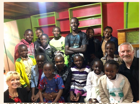
JFM SPONSORED STUDENTS FROM CENTRAL KENYA

We had an opportunity to meet with almost every Kenyan child who is being assisted through JFM donations made by caring souls in America. The students are coping well under the pressure of extra studies. They are very thankful for the assistance!