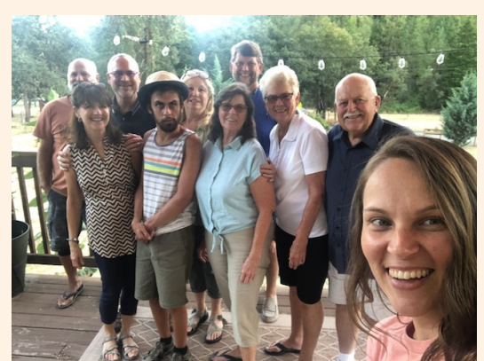
Jacksonville Oregon Missions Prayer Team

This missions prayer team has been faithfully praying for Jesus Frees Ministries. The Bible says, "The earnest prayer of a righteous person has great power and produces wonderful results. (James 5:16b)" We are grateful to everyone who prays for us and the mission of JFM!