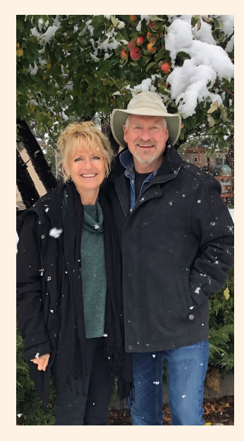
Freeses in Oregon 11-2022