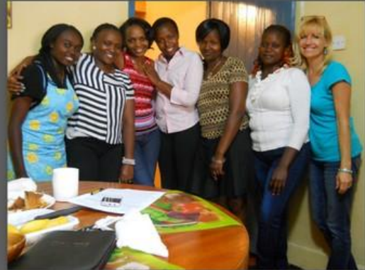
Some of the Tuesday Tea & Bible Study Group