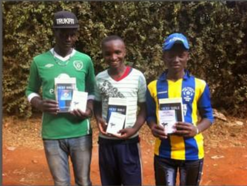
Three new believers receive Bibles.