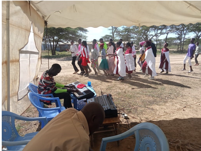
Outreach at JFM Liasho