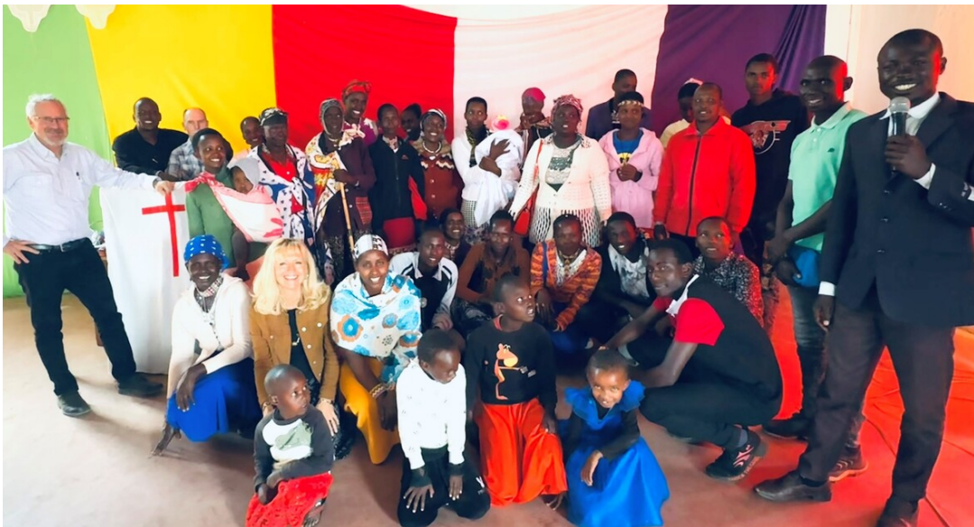
JFM Chumvi Church - June 2024