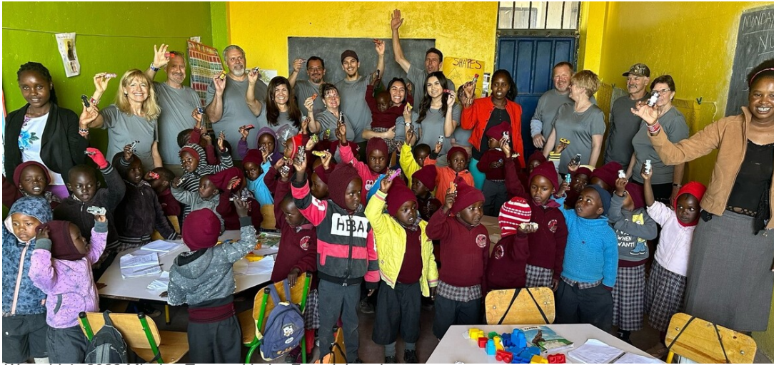
Westside's 2023 Mission Team with the Entapipi students