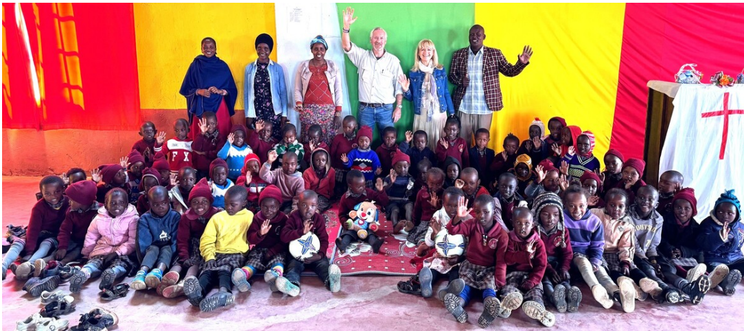
The teachers received two large carpets to use during story time and play time, two soccer balls, and an interactive toy.