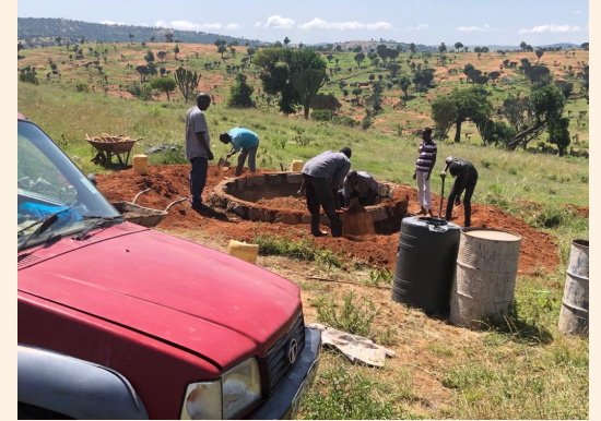
Water tank platform being built