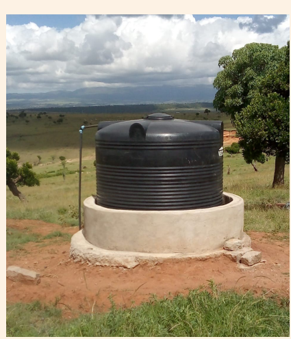
Water tank in place and pipes laid to well