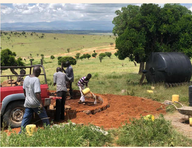
10,000-liter water tank