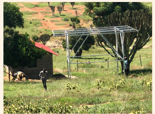
Solar tower and pump house

A big "THANK YOU" to those who contributed to this great project!