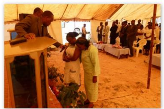
This nurse received Jesus at the end of the opening ceremonies!