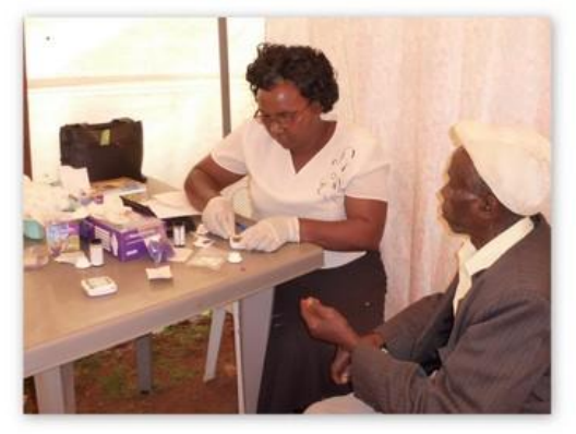
Blood Sugar Testing