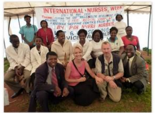
Some of the volunteer Nurses and Clinicians