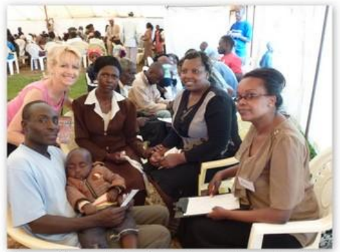
Together this husband and wife gave their lives to Jesus