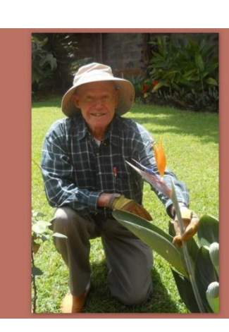
Pop-Art Price 2015

However, she still has that sweet smile, the love of the Lord is still in her heart and she still remembers the old hymns and choruses!!!