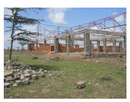
Everything needed to complete the roof will be delivered this week!!!