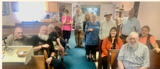
Awesome Bible Study with some of the members of the Olney Community Church