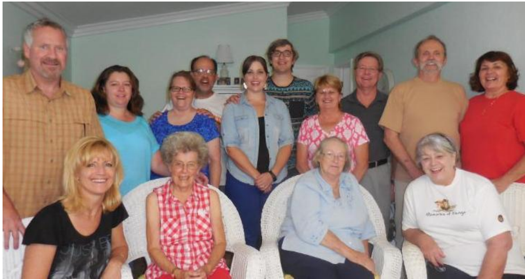
Friends of JFM - California