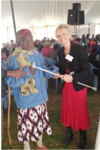
Left: Thank you to the Nyeri Lions Club for their donation of 8 walking canes.