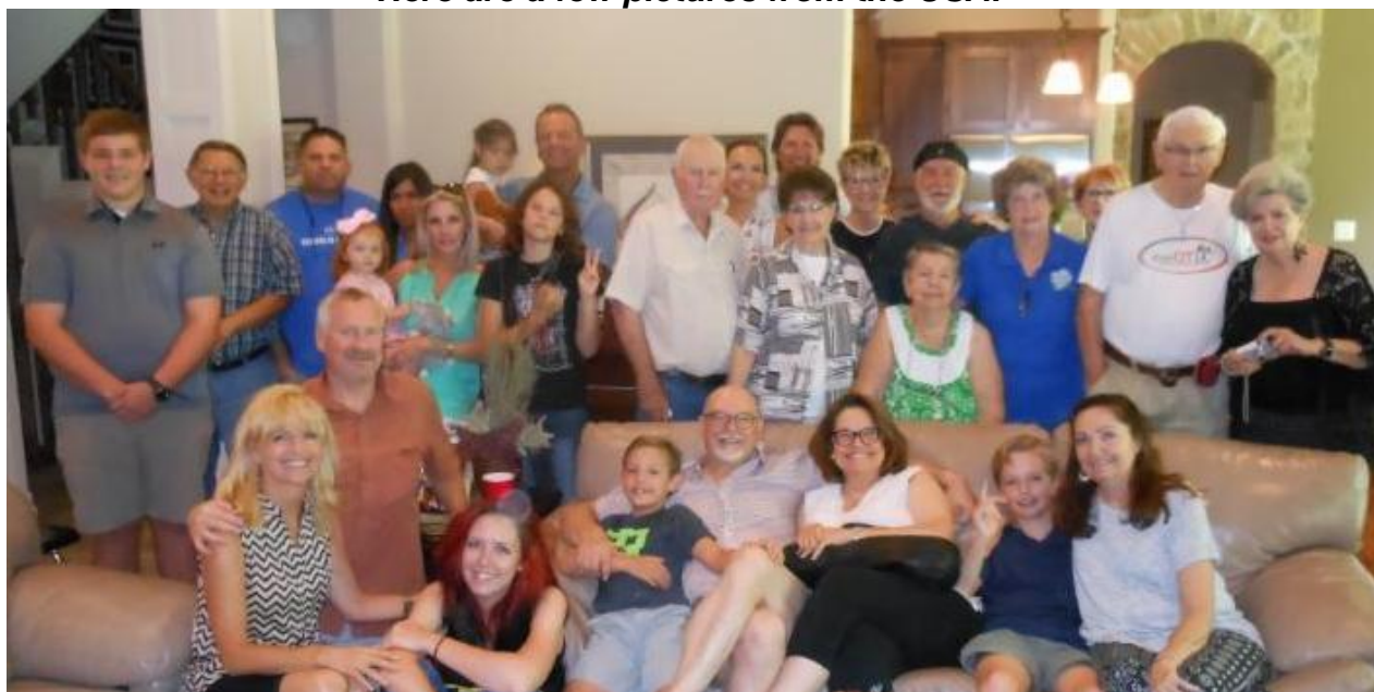
Price Family Reunion in Texas

After a wonderfully successful 2 1/2 months in the USA, we returned to Kenya mid-August 2016. Here are a few pictures from the USA: