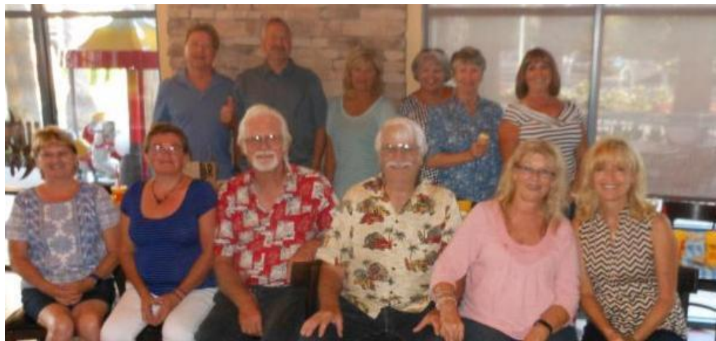
A Big "Thank You" to These JFM California Friends for Lending a Helping Hand!!!