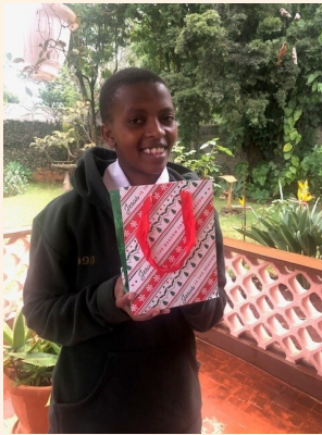
Jackline-Sponsor The Shoppells