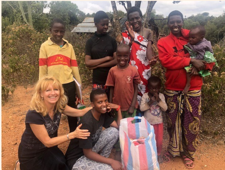
Thankful for the support to JFM that makes it possible to bring food relief to families in need.