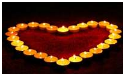
Our Unborn Children