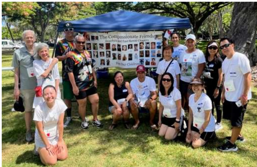
The Compassionate Friends Honolulu Walk to Remember on June 2024

Honor and remember your child at TCF 2025 Honolulu Walk to Remember on Saturday, June 21, 2025, 9:00am-12:00pm, at Kapi'olani Park Bandstand Oceanside. Registration forms are available at event.