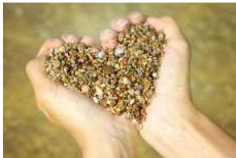
Our Unborn Children