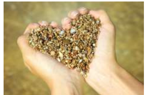
Our Unborn Children