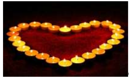
Our Unborn Children