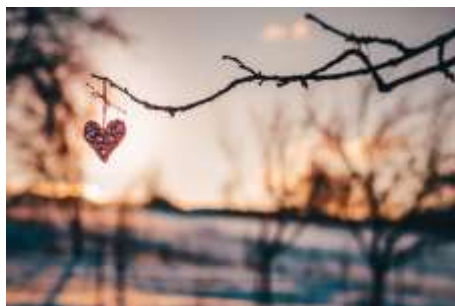
Our Unborn Children