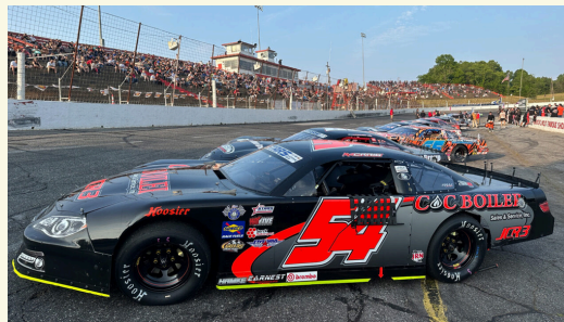
Hickory Motor Speedway - 10 Minutes by car