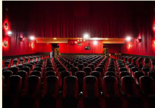
Newton Performing Arts Center - 10 Minutes by car