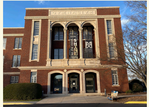
Catawba County Museum of History - 10 Minutes by car