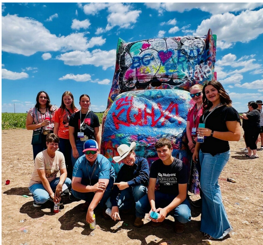
2024 KQHYA Youth Excellence Seminar attendees