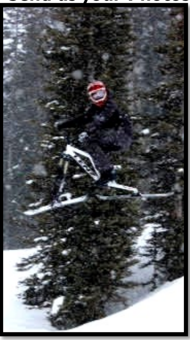
An Action Photo