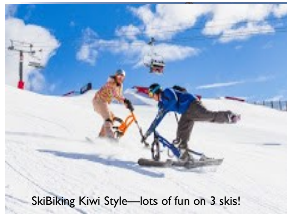
SkiBiking Kiwi Style—lots of fun on 3 skis!

New Zealanders enjoy 23 ski fields predominately in the South Island and although of a smaller scale 16 of these have lifts suitable for Ski Biking. The largest field Whakapapa on the North Islands active volcano Mt. Ruapehu has 11 lifts covering 550 hectares of maintained terrain. Ski/Snow Biking in New Zealand has been around for decades however in the modern format only for about 10years. With the local development of 3ski Snow Bikes the 3-ski or Trike concept is very much the normal and we enjoy 100% access at all the resorts with compatible lifts, most of the major resorts have official policies covering the use