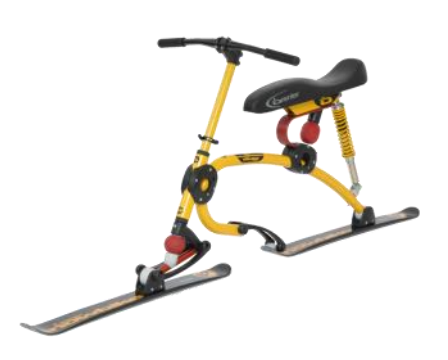
Brenter C6 HD The same C6 Design with an added rear shock for heavier riders.

The focus of the Brenter company is primarily recreational riding, with several SkiBikes based around their most popular C6 All Mountain Bike. This Classic C6 Skibob model was upgraded from the C4 several years ago, with lighter and stronger components to address the rugged demands of the rental stations that have developed all over the world. Brenter currently has over 50 independent demo/rental stations worldwide to promote the sport and their brand. Brenter footskis are now tailored to fit alpine or snowboard boots, and specialty skis