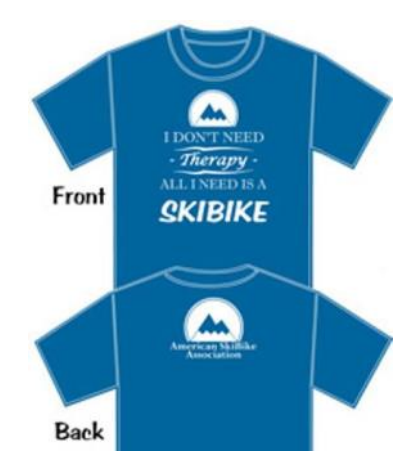
Limited 2018 Shirts Just a few Remaining @ $10.00 ea