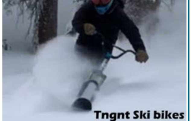
Tngnt Ski bikes