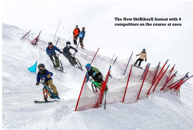
The New SkiBikerX format with 4 competitors on the course at once

Both Utah and Colorado's races are set for 2024 with more prize money and more sponsors getting n the bandwagon. Come join us! January 20th in Utah and February in Colorado.