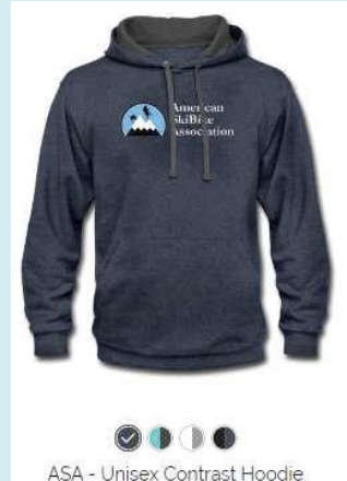
ASA - Unisex Contrast Hoodie

But how are SkiBikers going to react to these modifications? We need to be patient and be thankful we have the privilege to ride. We are a sturdy bunch. It may change our travel patterns, lodging choices, and what dates we choose to go. Many of us will ride mid-week and avoid the crowded Holiday weekends. Let's get out there and have some fun!