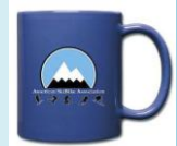
ASA LOGO - Full Color Mug