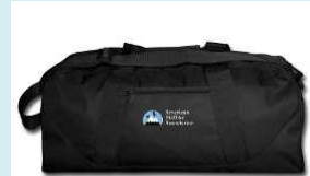
ASA - Logo- Winter Scene - Duffel Bag

Great Holiday Shopping at the ASA The Merchandise page