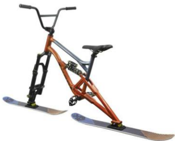
Tngnt Carve 2.0

The Drift is their hard tail entry level model with the best retail price in the business. It features a hardtail design with their other standard features that have proved popular last year.