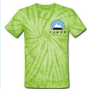
ASA - Front & Back - Unisex Tie Dye T-Shirt