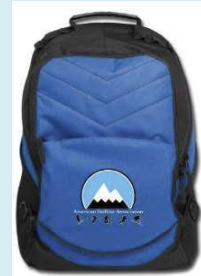
ASA - Computer Backpack