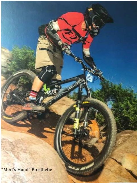
"Mert's Hand" Prosthetic