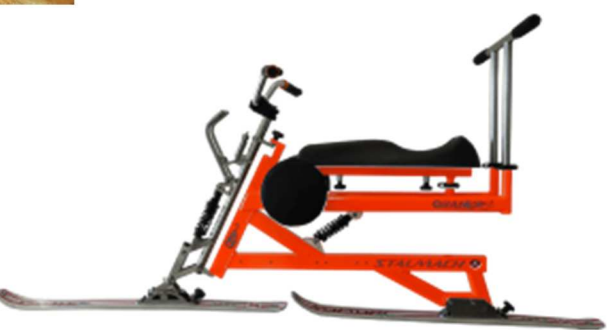
Stalmach's Adaptive "Quan" SkiBike