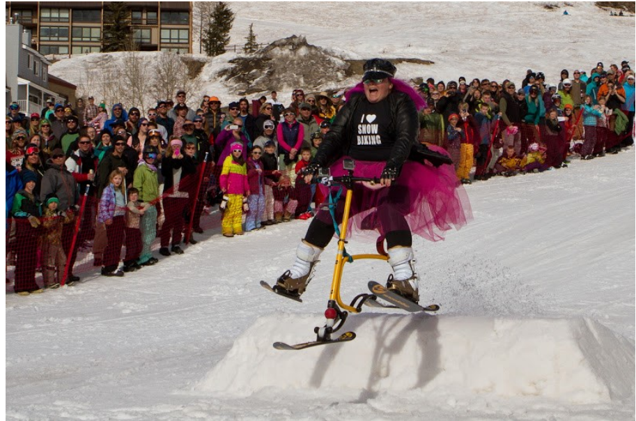
Springtime SkiBike Fun!