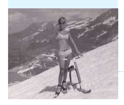
Early Brenter Promotional photo circa 1960s