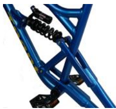
New Tngnt Rear configuration

The Type II Freestyle bikes have new offerings from all 4 companies; Lenz, SkiByk, Tngnt and Sledgehammer all have new models available with upgrades available in shocks, skis and frames. The quality of the class of 2020 continues to be excellent!