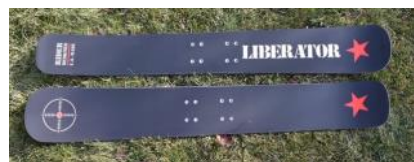
Liberators From SkiByk