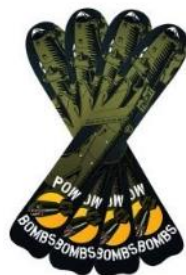
Tngnt Pow Bomb Powder Ski

This Holiday Season reach out to the SkiBike brands for your Holiday Shopping. They all have great websites and the owner’s still answer the phone to handle questions .Our industry still has a small personable touch to it. Best of all the owners still answer your phone call.