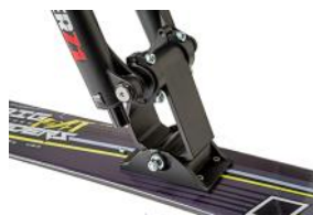
New 2020 Lenz Front