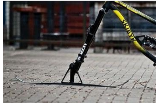
New SB200 from SkiByk