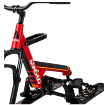
The 2020 Sno-Go

The Type- III Bike has really caught on in the USA and Sno-Go is the hottest new seller for 2020. Sno-Go's Standard Model has been refined to lighten the bike by several pounds with its price lightened up too for season ahead.