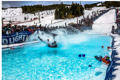
Plunging into Summer at Breckenridge