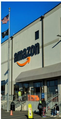
Amazon Prime members

Special Projects Small Group We meet the 3 rd Monday of each month, from 10:00 - 2:00, in Sengal Hall at St. Theodore's Church. Each month we work on a different project, with instructions and materials provided. Projects are beginner-friendly but also interesting to more experienced quilters, and are chosen to meet specific needs identified by our community. Come whenever you can, bring your lunch, and stay for as long as you want. Everyone is welcome!