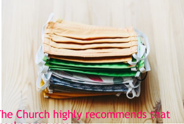
The Church highly recommends that masks are worn.

Volume 29, #4 calicocutups.com admin@calicocutups.com