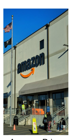
Amazon Prime members

Special Projects Small Group We meet the 3<sup>rd</sup> Monday of each month, from 10:00 - 2:00, October 17th in Sengal Hall at St. Theodore's Church. Each month we work on a different project, with instructions and materials provided. Projects are beginner-friendly but also interesting to more experienced quilters, and are chosen to meet specific needs identified by our community. Come whenever you can, bring your lunch, and stay for as long as you want. Everyone is welcome!