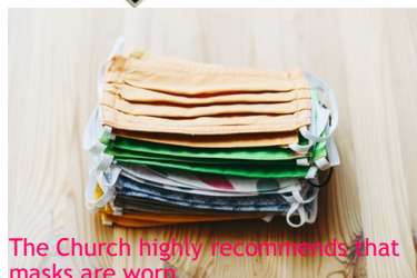
The Church highly recommends that masks are worn.

Volume 29, #1 calicocutups.com admin@calicocutups.com