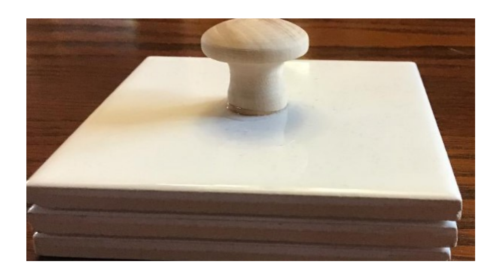
WHAT I LEARNED ABOUT QUILTING DURING THE 2020 COVID PANDEMIC

All of us during the 2020 Covid pandemic have experienced shortages of fabric, elastic, thread, and notions. We have relied on our stash of fabrics to make masks, quilts, etc. I am very thankful to have had my stash. But I also learned to make do and improvise to complete a project, perhaps use a ruler I had but never used, or used the internet to learn a new technique or instructions on how to make a block.