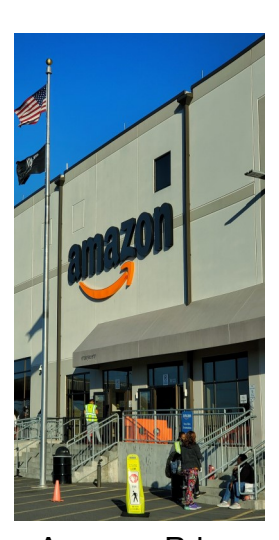
Amazon Prime members

Special Projects Small Group We meet the 3<sup>rd</sup> Monday of each month, from 10:00 - 2:00, August 18th in Sengal Hall at St. Theodore's Church. Each month we work on a different project, with instructions and materials provided. Projects are beginner-friendly but also interesting to more experienced quilters, and are chosen to meet specific needs identified by our community. Come whenever you can, bring your lunch, and stay for as long as you want. Everyone is welcome!