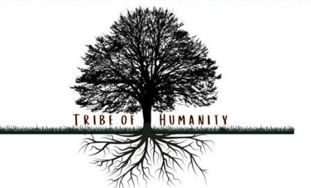
HAND 2 HAND: BARTER AND TRADE