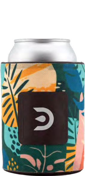
12OZ STANDARD CAN