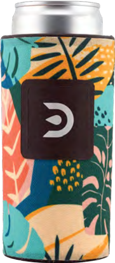
12OZ SLIM CAN