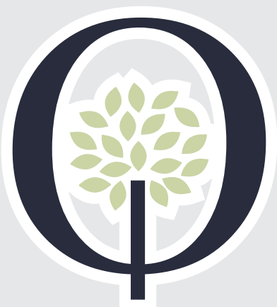
requires a background and satin stitch *all details can be chenille