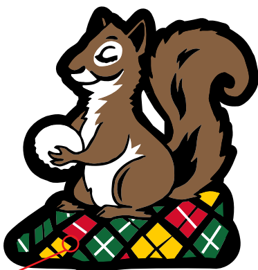
details too small for chenille, so embroidery is used