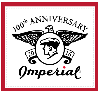
18. LG. SQUARE 1.75"W x 1.6"H 1.6"W x 1.45"H