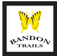
2. SMALL SQUARE .95"W x .95"H .8"W x .8"H