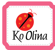
3. SMALL NOTCHED CORNERS .95"W x .85"H .8073"W x .70"H