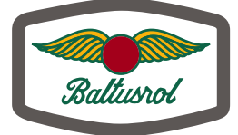
11. IRREGULAR RECTANGLE 2 1.25"W x .8"H 1.1"W x .65"H