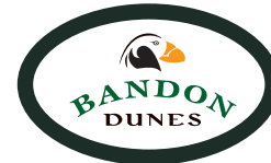
10. LAY-DOWN OVAL 1.25"W x .77"H 1.1"W x .62"H