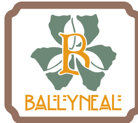
9. MEDIUM NOTCHED CORNERS 1.4"W x 1.25"H 1.25"W x 1.1"H