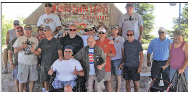
McHenry MCL Annual Fishing Derby

Part of our mission as The Marine Corps League is to provide support and assistance to all past, present and future Marines! We, as Marines and/or family members, have experienced being away from our loved ones. We know what it is like to be away from home whether it is at a duty base in the states or overseas in a strange land. It is now our turn and obligation to provide the "Marine Family" support to those still in combat and those returning from harm's way as well as all those non-combat individuals that support our troops.