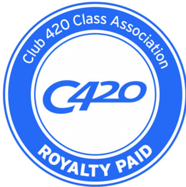
EXHIBIT B- Class Legal Sail Patch