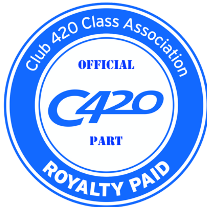
EXHIBIT C- Class Legal Parts Sticker