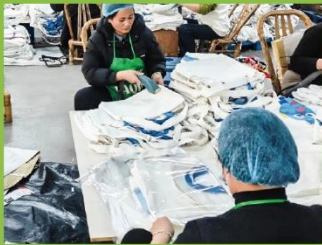
Check the packaging