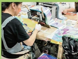
Printed bag making