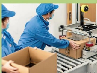
Delivery from warehouse