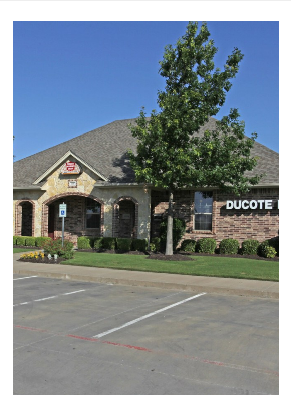
805 FM 1187 E 805 FM 1187 E, Crowley, TX 76036