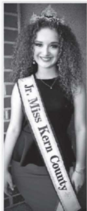
Foster Care Advocate