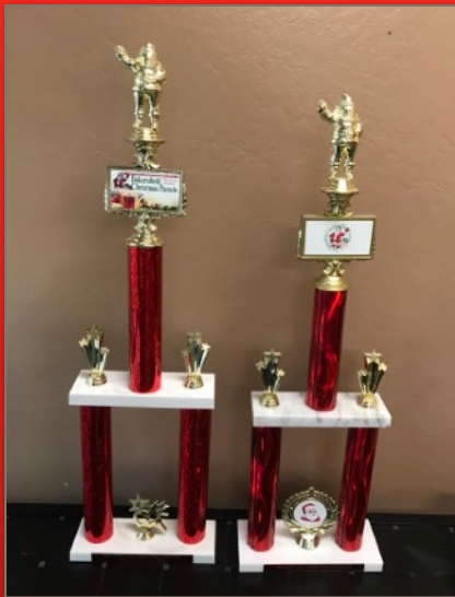
Christmas parade trophies from prior years

This year KBYH will once again be entering a float in the Bakersfield Christmas parade. If you are interested in helping with the float, we are looking for helpers on the morning/afternoon of the parade. Also, if you or someone you know would want to sponsor our float (with their name or business name on the float), let us know. Or, if you just want to say hi, be sure to get our attention as we pass by. This year's parade will be on December 1 and we have every intention of taking home the grand prize this year!