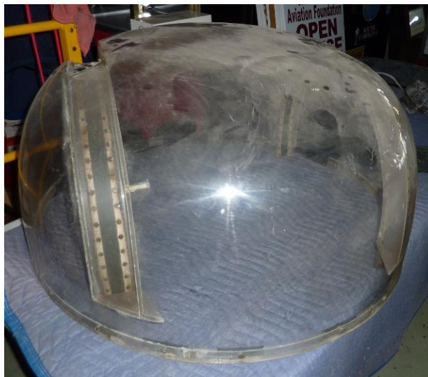
Dome to be placed on top of turret