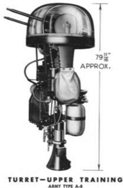
Picture of turret as originally produced