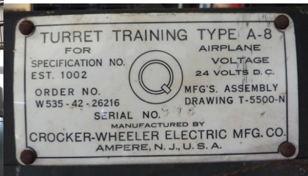
Data plate on the turret