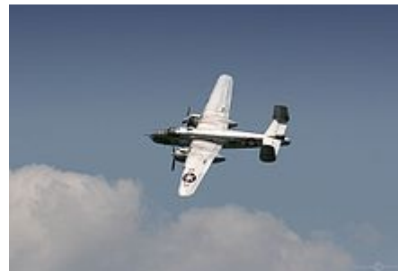
B-25J 44-30832 Take-off Time