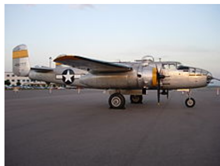
B-25J-30NC 44-86777 Martha Jean of Blue Yonder, Inc