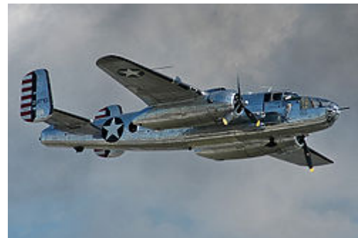
The Vintage Flying Museum's B-25J, Pacific Prowler

A significant number of these were brought together for Catch-22 , a 1970 war film adapted from the book of the same name by Joseph Heller. When Catch-22 began preliminary production, Paramount hired the Tallmantz Aviation organization to obtain available B-25s. Tallmantz president, Frank G. Tallman ended up finding war-surplus aircraft, and eventually gathered not only pilots to fly the aircraft but also a ground support crew to maintain the fleet.