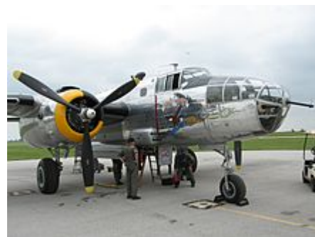
B-25D 43-3634 Yankee Warrior