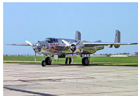
B-25J 44-86893 of the Flying Bulls in Austria