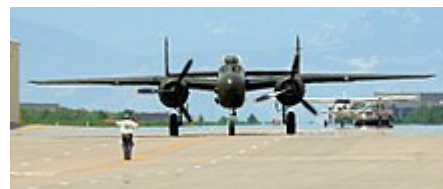
B-25H Barbie III taxiing at Centennial Airport, Colorado