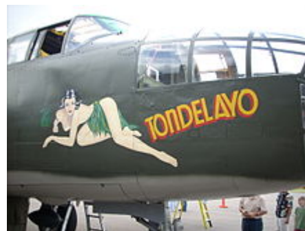
B-25J 44-28932 Tondelayo