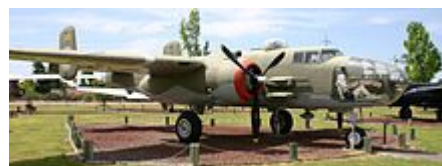
B-25J 44-86891 Lazy Daisy Mae at former Castle AFB, California