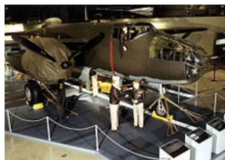
F-10D 43-3374 at the National Museum of the U.S. Air Force (in Doolittle markings) at Wright-Patterson AFB, Ohio