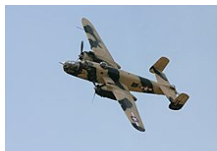
B-25J 45-8811 Russell's Raiders at the 2007 International Air Picnic in Góraszka, Poland