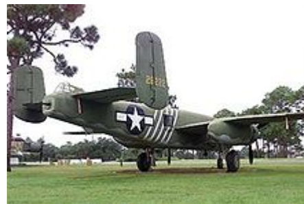
B-25J 43-28222 at Hurlburt Field, Florida