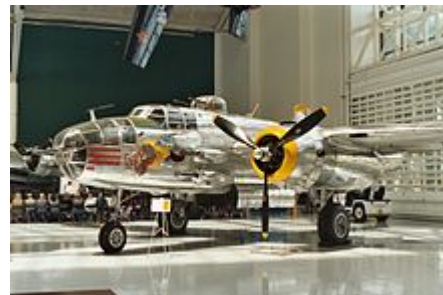
B-25J 44-86725 Super Rabbit at the Evergreen Aviation Museum