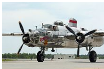
B-25J 44-30734 Panchito of Rag Wings and Radial Aircraft