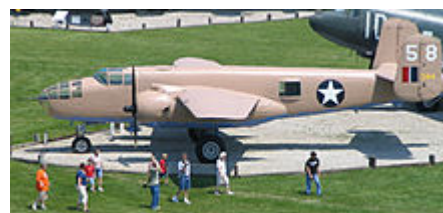
B-25J 44-86843 at Grissom ARB, Indiana