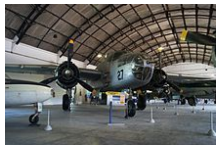
B-25J Mitchell - 44-30069 at Museu Aeroespacial in Campos dos Afonsos Air Force Base - Rio de Janeiro