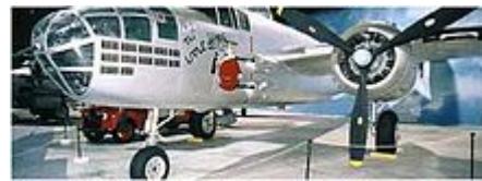
B-25J 44-86872 Little King at Robins AFB, Georgia