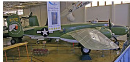
B-25J 44-86772 at the Hill Air Force Base Museum, Hill AFB, Utah