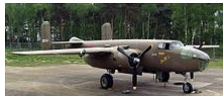
B-25J 44-29507 Sarinah of the Duke of Brabant's Air Force