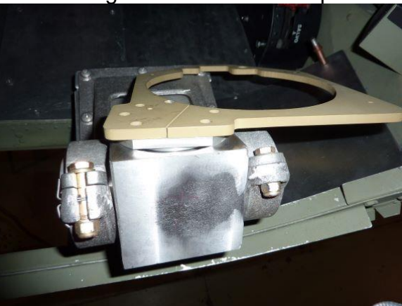
Note the hand-made thumb lever and latch