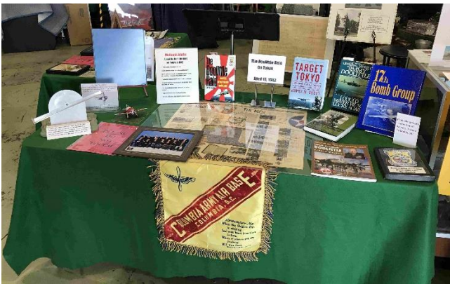
Doolittle Raider and Columbia Army Air Base Display