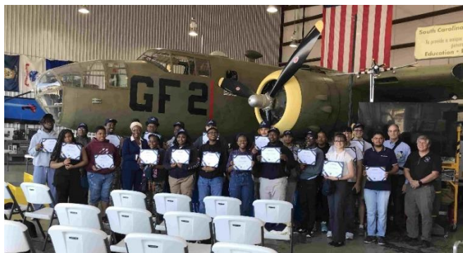
Midland's youth after signing commitments