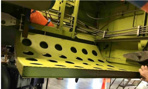
Door closed view from inside bomb bay

After almost 10 months of detailed work, the final touches are being completed on the port side bomb bay door. All that remains is the final coat of paint then permanently attaching the door to GF2. The work on the starboard door has already begun. As you may notice in the pictures, these are a little over 1/3 size doors. This is so visitors can stand inside the bomb bay to watch how the controls open and close the doors.