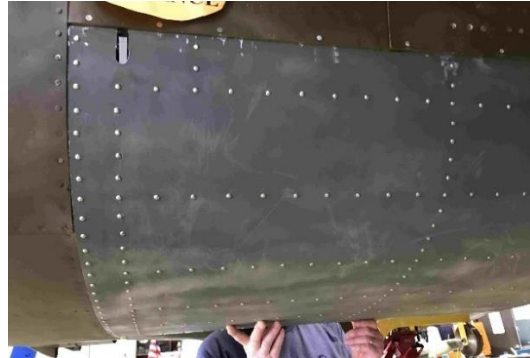
Door closed view from outside of plane