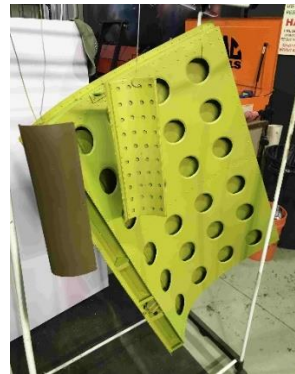
Final coat of interior paint. Note the small doors for the model B-25