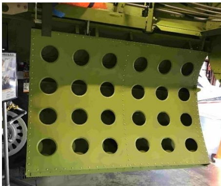
Door hanging open