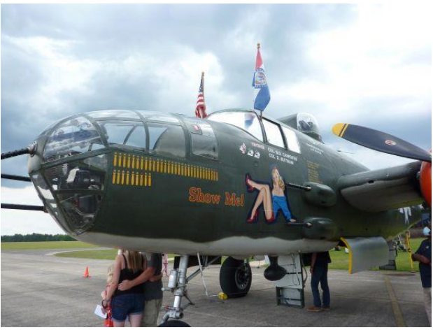
Commemorative Air Force B-25