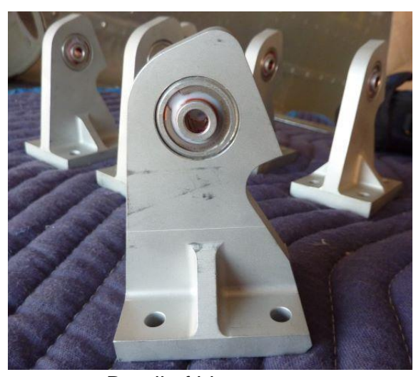
Detail of hinge